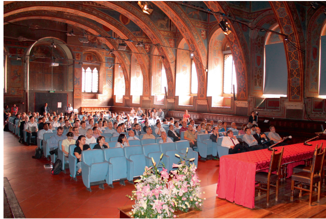
Fig. 3. La Sala dei Notari during the CCWI2013 opening session.